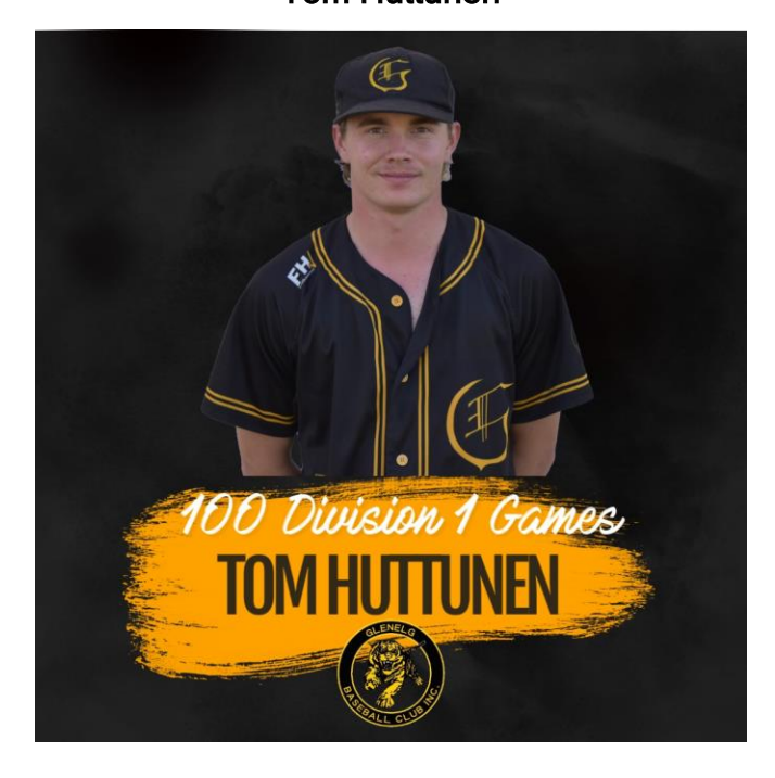
Division 1 – 100 Game Cap